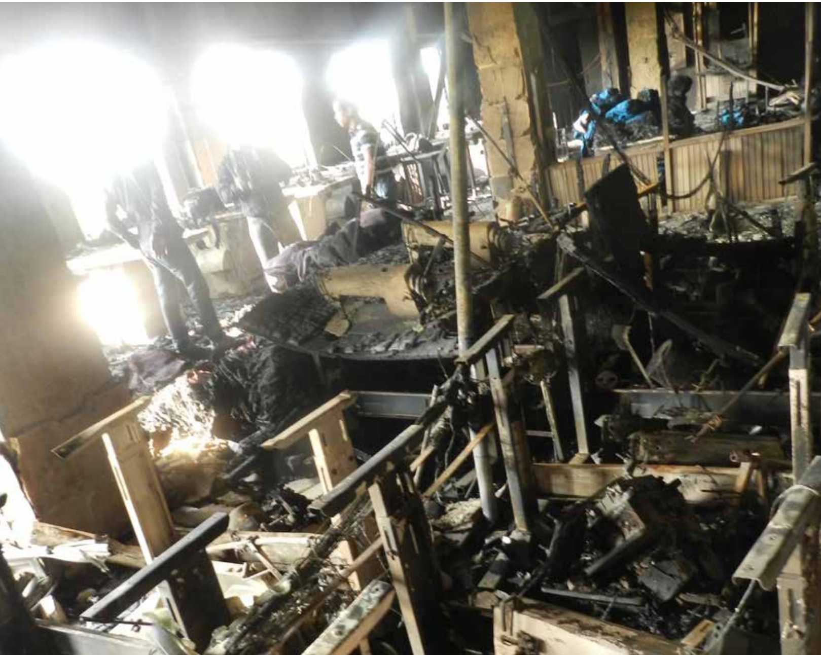
Inside Tazreen Fashions, the day after the factory fire.