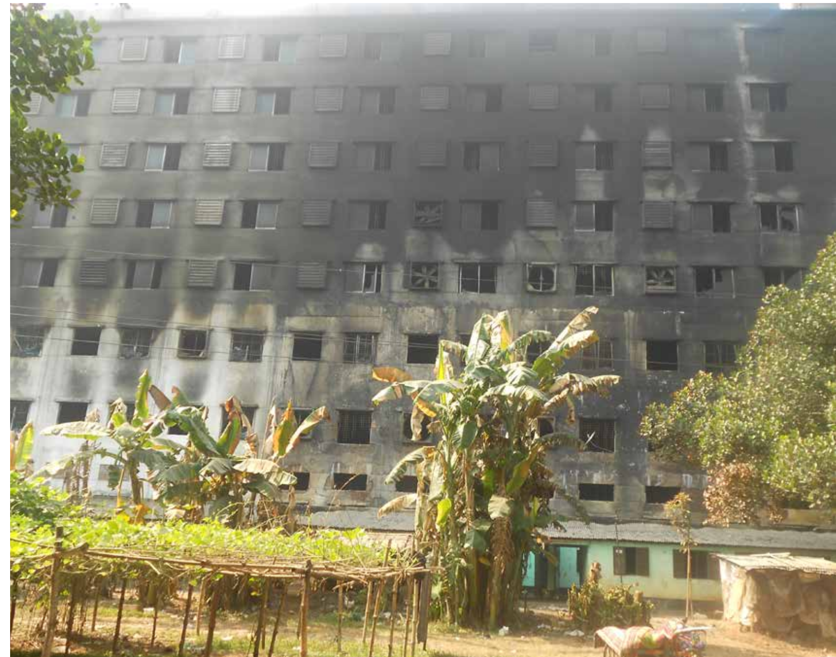
Tazreen Fashions factory, after the fire.

All the US corporations including Walmart, Sears/Kmart, Enyce (Sean John Apparel), Delta Apparel, Dickies and Disney along with French brand Teddy Smith, have refused to pay any compensation to the victims, have failed to attend the meetings on Tazreen compensation and have not been willing to engage with trade unions directly to arrive at full and fair compensation for Tazreen victims.