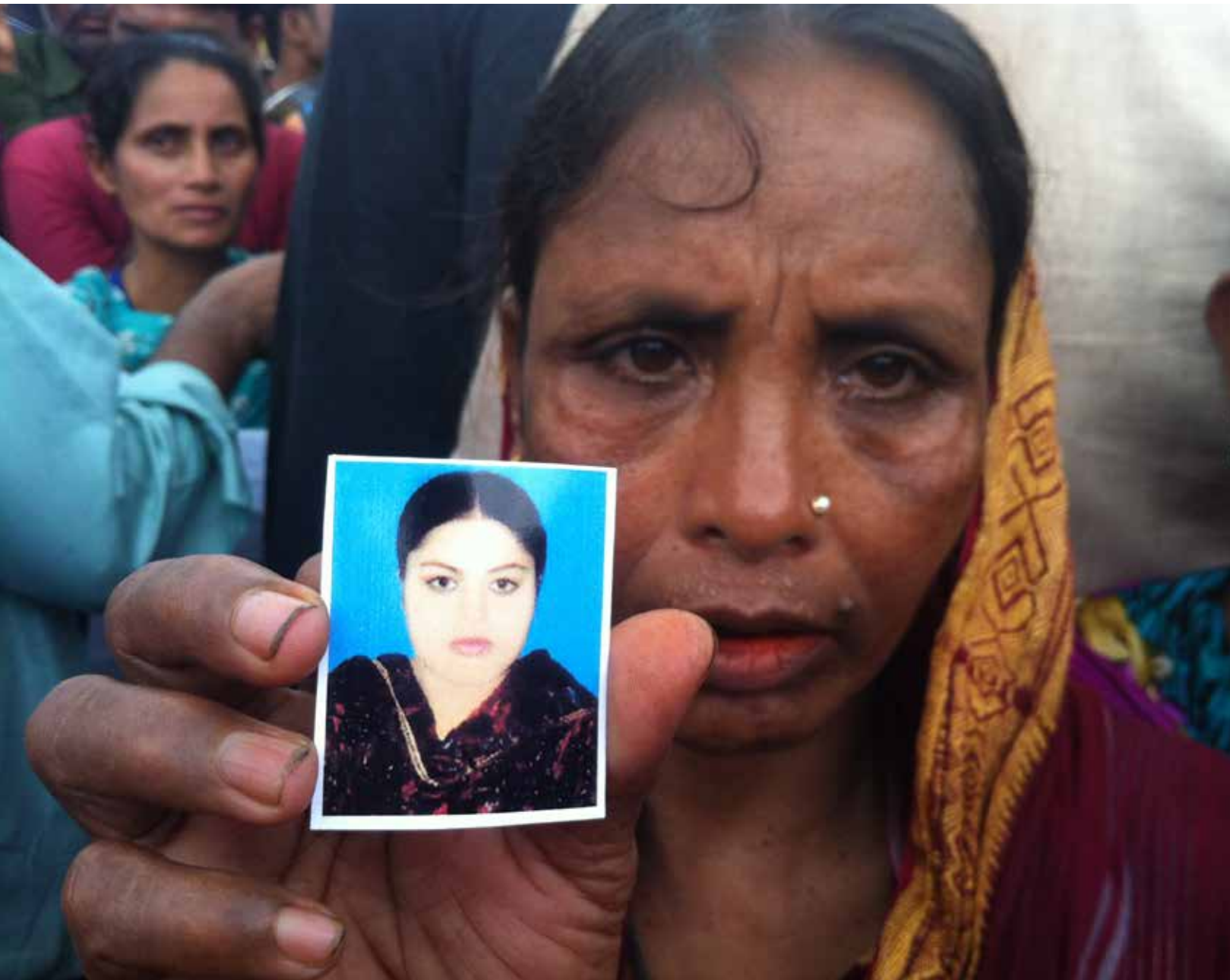
A mother mourns the loss of her daughter at Rana Plaza.