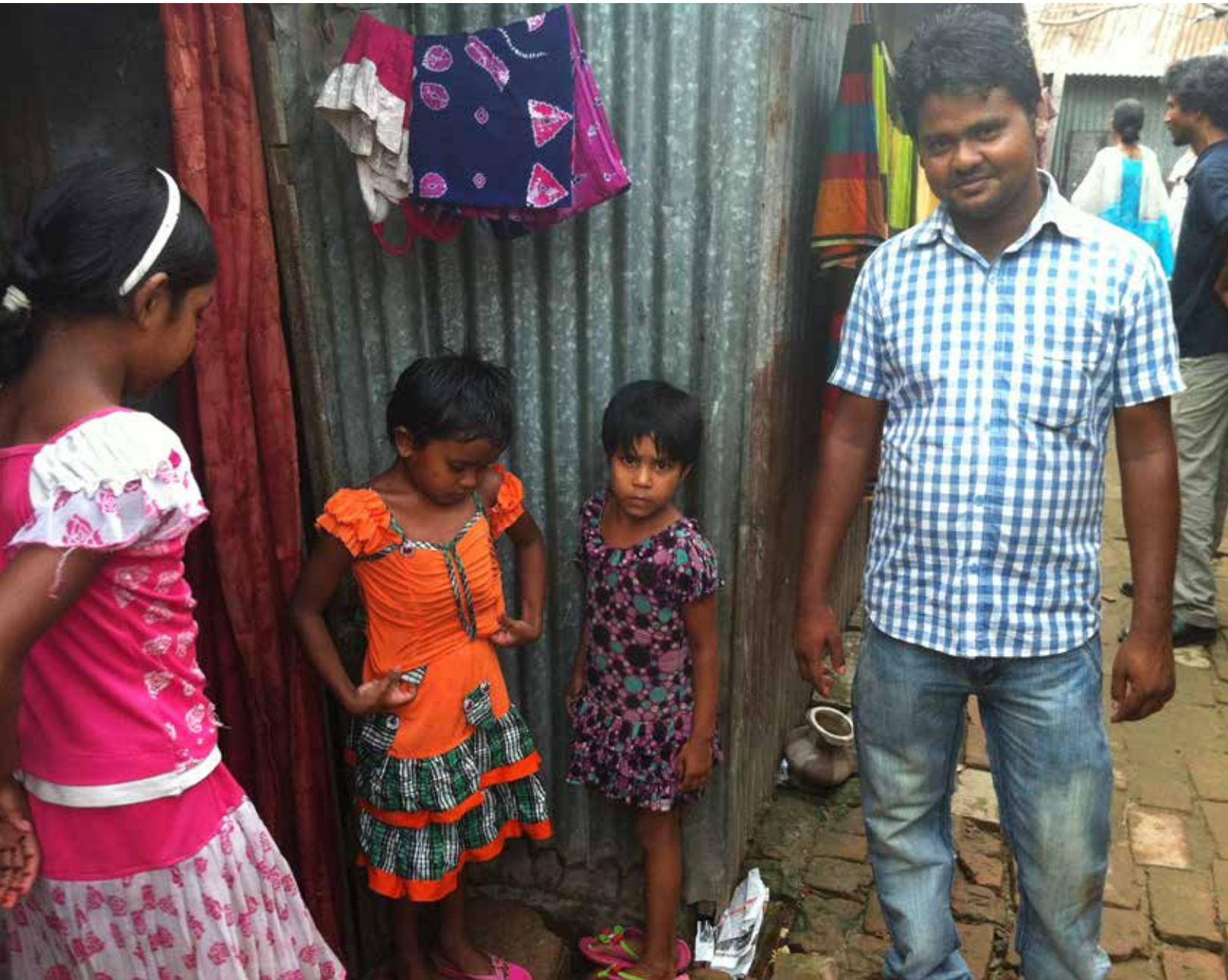
Garment workers live in concentrated housing communities. Many families live in one-room structures beside dozens of other families with whom they share common kitchen, water, and bathing areas.

“WE HAVEN’T BEEN ABLE TO PAY OUR RENT... ALREADY SOME PEOPLE HAVE LOST THEIR ROOM.”