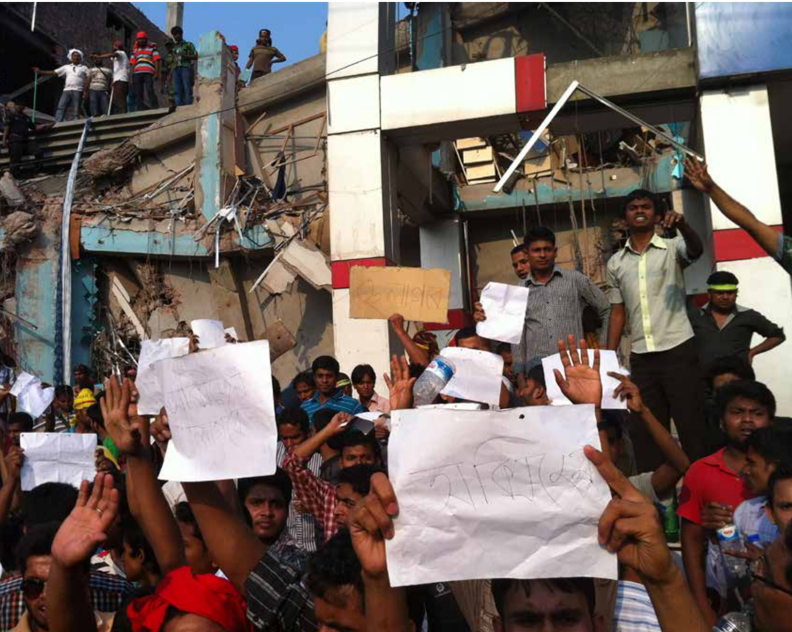
Amidst rescue efforts at Rana Plaza, workers call for help.

In addition to the compensation initiatives detailed above, in recent months several other initiatives have taken off in the Bangladesh garment industry in the areas of safety, labour law, and wages. This section summarizes key efforts in these areas.