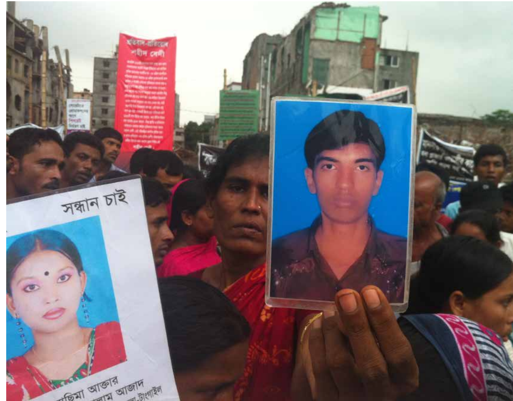
Demonstration in front of Rana Plaza on the International Day of Action to End Deathtraps, June 29, 2013.

The ILO sent a high level expert delegation to Dhaka in the first week of October to discuss matters with the government and all stakeholders concerned.