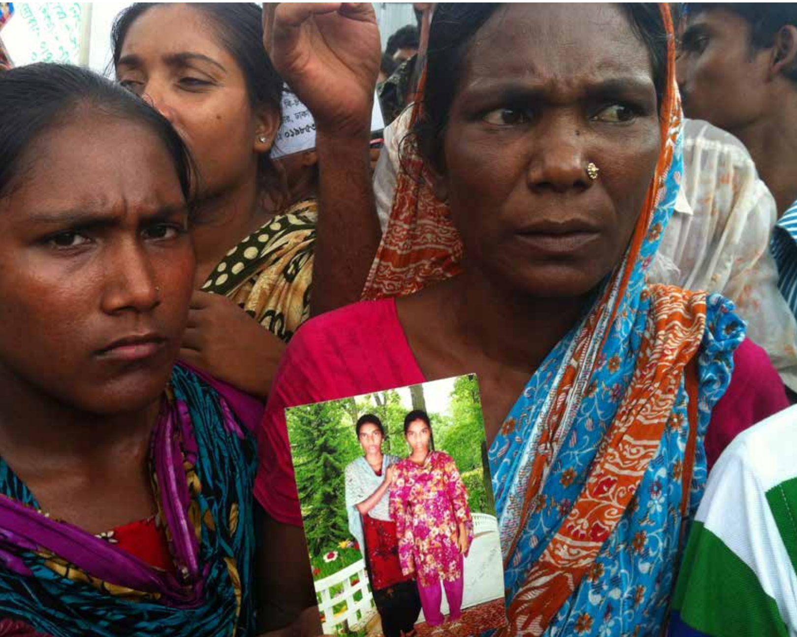
Family members of Rana Plaza building collapse victims.

On April 24, 2013, the Rana Plaza building in Dhaka, Bangladesh, which housed five garment factories, came crashing down, claiming at least 1,132 lives. Cracks had appeared in the wall the previous day, yet thousands of garment workers were forced to return to work in the factories housed on the upper floors.