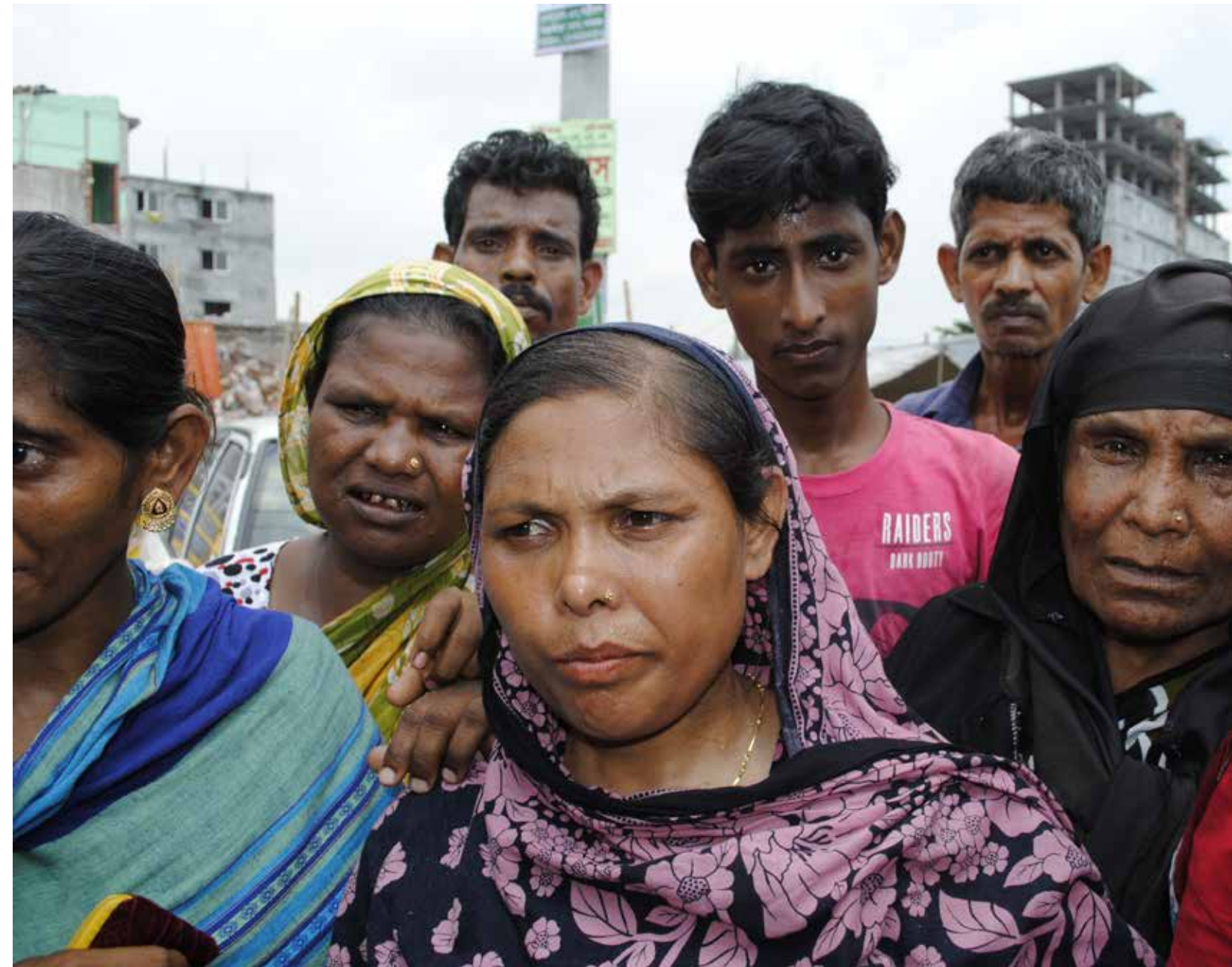
Affected family members.