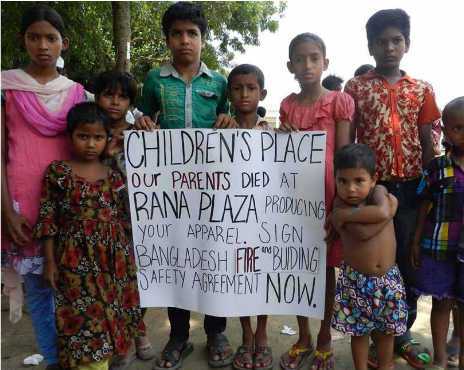
Orphans call on Children's Place to pay the compensation they owe and to sign onto the Safety Accord.

Bangladesh has long pursued the low road to industrialization, building a garment industry that has cut corners at every turn, underinvesting in infrastructure, worker safety and worker compensation. Global brands, which have continued to expand production, have helped fuel Bangladesh's low-road strategy. This strategy has secured Bangladesh its place as having the lowest paid garment workers in the world. It is also responsible for turning Bangladesh into the most dangerous place to be a garment worker.