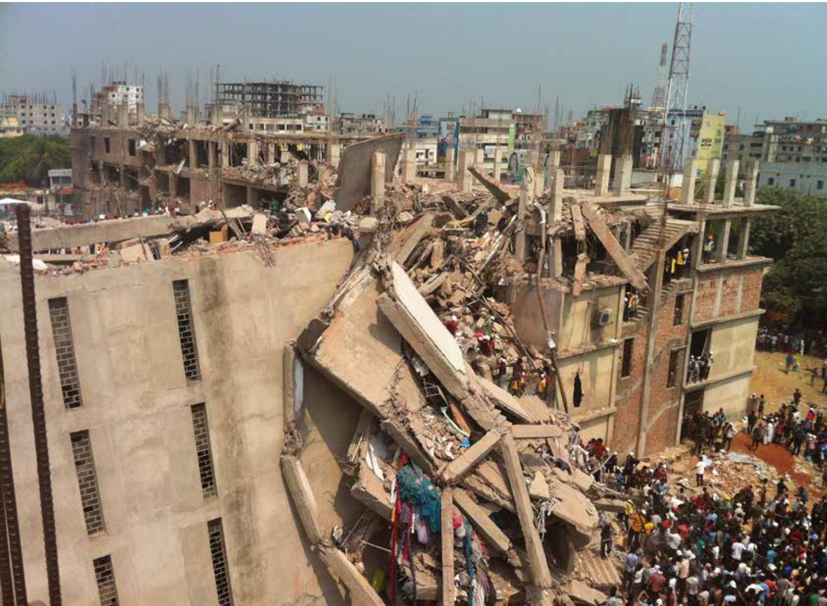
Rana Plaza building collapse, April 24, 2013.

Six months after the Rana Plaza building collapse and eleven months after the Tazreen Fashions fire, the injured workers and the families who lost loved ones face immense financial hardship. In addition to the physical pain and psychological trauma, they are suffering from loss of income while continuing to await full and fair compensation from government, factory owners, and European and North American brands and retailers.