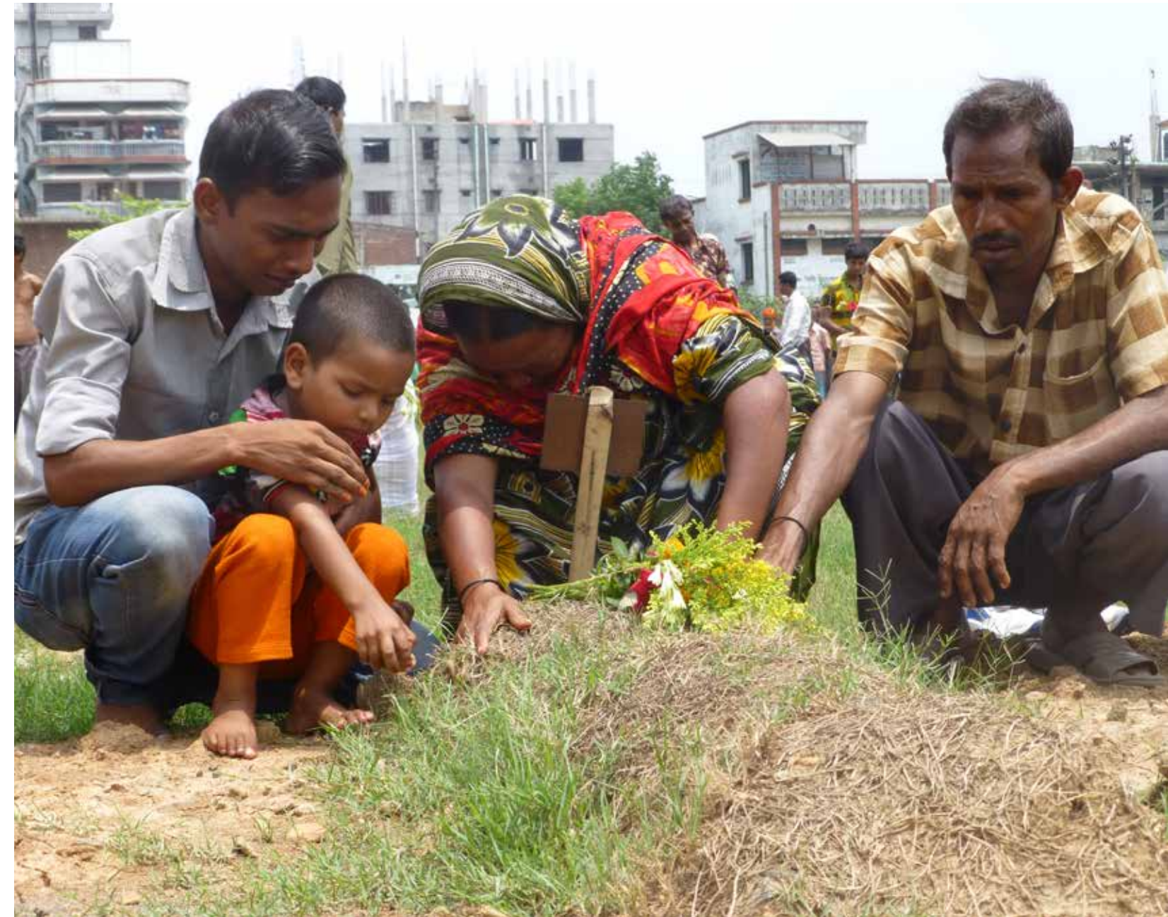
A family of a Tazreen garment worker visits the Jurain graveyard. They have yet to receive the full compensation due to them.