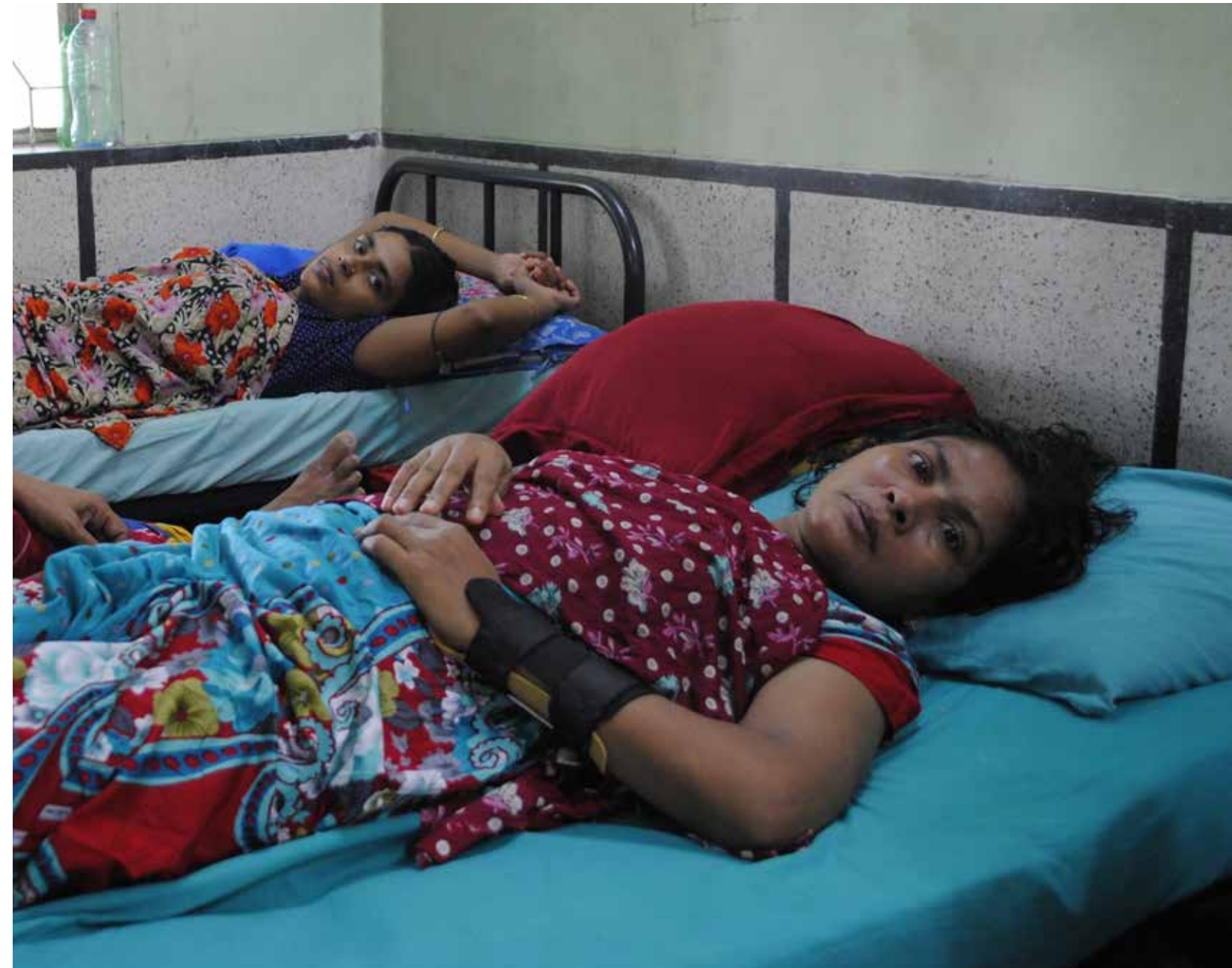
Workers who were injured in the building collapse.

The Bangladesh Garment Manufacturers and Exporters Association claims that 2,759 workers were provided their owed salaries including overtime and benefits. The payment that workers received included an average of 60 overtime hours. Hundreds of workers did not receive any wages at all. Many workers had to surrender their factory identification cards when collecting unpaid salary, and they now remain concerned that this will prevent them from accessing further compensation once it becomes available.